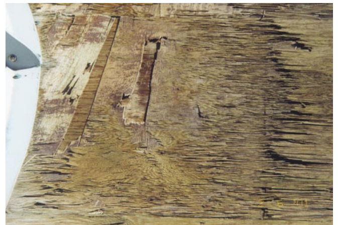
This plywood fan deck has rotted away making it dangerous for workers to walk on.

For more EXTREN® design information, visit www.strongwell.com/designmanual for the online Strongwell Design Manual!