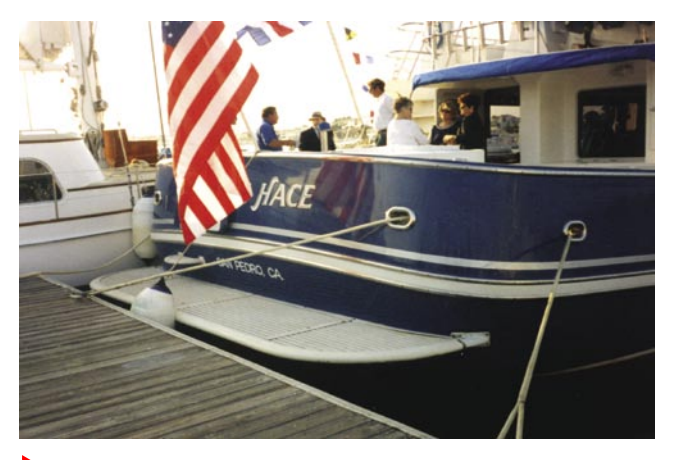
Swim platforms made of fiberglass grating and structural shapes are slip-resistant and will not rot or corrode.

Fiberglass is the long lasting, low maintenance structural alternative for boats, docks, decks, piers and other marine industry applications.