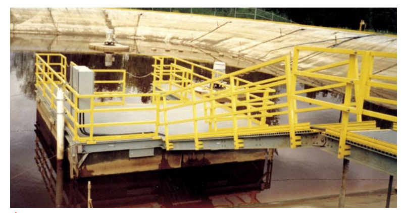
This floating dock uses lightweight, maintenance-free fiberglass handrail, flooring and structural supports.