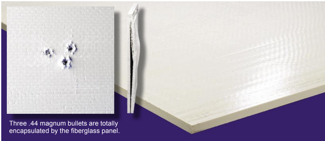
Three .44 magnum bullets are totally encapsulated by the fiberglass panel.

Strongwell's HS Armor panels were initially designed for the U.S. military. The panels provided overhead protection for troops stationed in Iraq. Since then, Strongwell has advanced the ballistic panel technology to include a wider range of armor types.