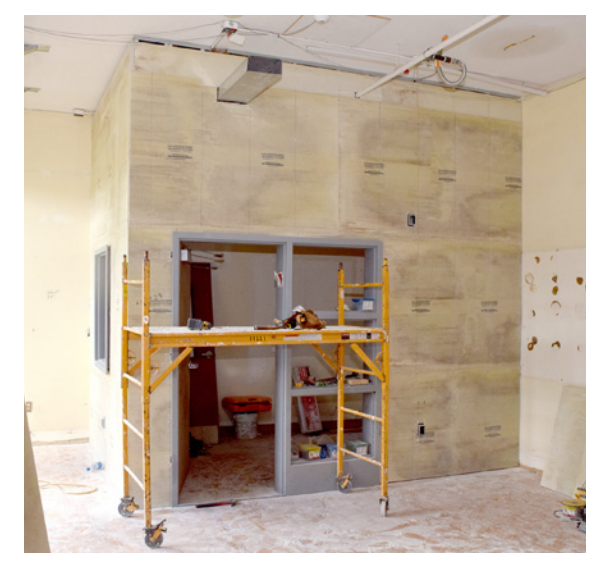
HS Armor can be finished to imitate drywall, as was done in the waiting area of this municipal building.

In addition to indicating panel width and length dimensions (max panel width is 4' in any length practical), it is vital to indicate the ballistic performance required, which will determine panel thickness and configuration. Panels, as manufactured, range in thickness from \frac{1}{4} " to \frac{1}{2} ". If final thickness is to be greater than \frac{1}{2} ", panels must be layered to meet more demanding ratings. For panels greater than \frac{1}{2} " thick, indicate whether panels are to be bonded or will be layered/bonded in the field during installation.