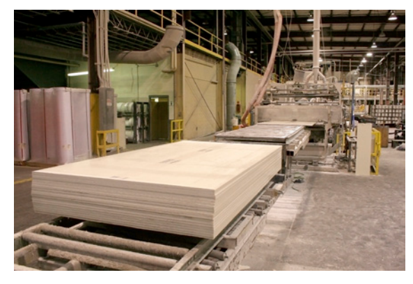
HS Armor panels are available in sheets up to 4' in width and in any practical length.

Strongwell's HS Armor fiberglass armor panels are designed for ballistics resistance. The panels are manufactured using specially constructed glass reinforcements in a proprietary resin matrix. The panel components are then cured in a controlled cycle.